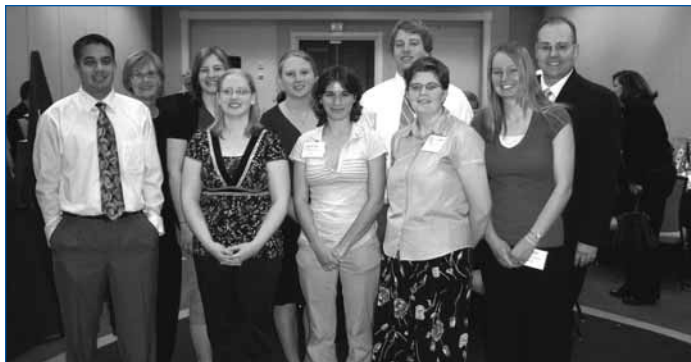
The courageous group from Wayne State College, NE, who drove straight through to Atlanta in order to attend the convention

We had a wonderful time at the convention last October (see photos) and are already planning for the next convention in October, 2011 in Washington, D.C. We would love to have you join us in our nation's capital to have fun, tour D.C., get to know other social science professors and students, gain knowledge, and catch our enthusiasm for Pi Gamma Mu. More details will be in future newsletters.