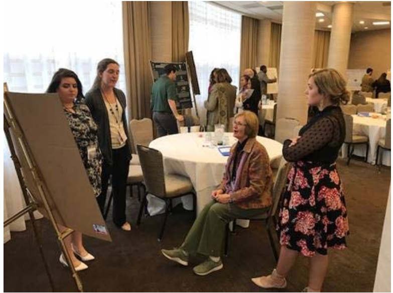
Student Poster Session at the Pi Gamma Mu 2017 Triennial International Convention.