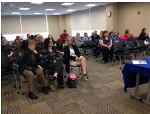
New initiates and their families gather at the Kansas Lambda chapter at Wichita State University on March 27, 2015.

Enjoy these snapshots from a few of the 2015 Pi Gamma Mu initiation ceremonies. Email your chapter's photos to ExecutiveDirector@PiGammaMu.org for inclusion in a future issue of the newsletter.