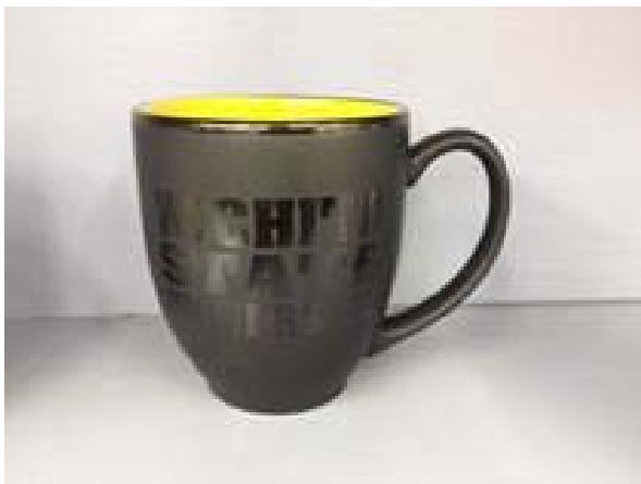
The newest addition to the collection – Wichita State University.