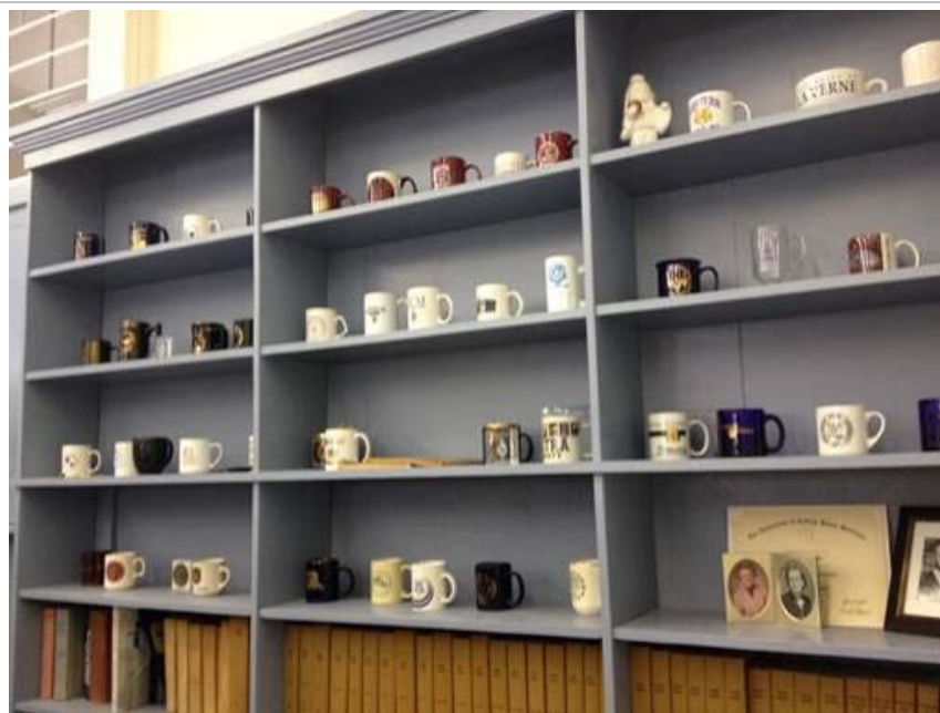
The complete collection.

Take a look at the photos below and see if your chapter is represented! Pi Gamma Mu is proud to display these meaningful gifts from its chapters.