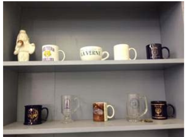
Top Row: University of the Philippines, Diliman (ceramic figurine); Western Carolina University; University of LaVerne; University of South Florida; Association of College Honor Societies. Bottom Row: Arkansas State University; University of Mary Hardin-Baylor; North Georgia College; Pace University; Rosary College.