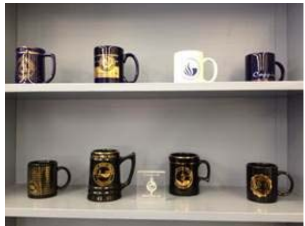
Top Row: Southern Arkansas University; Salisbury State University; Georgia State University; Coppin State College. Bottom row: West Chester University; Wayne State College; University of Wisconsin; Fairmont State College.