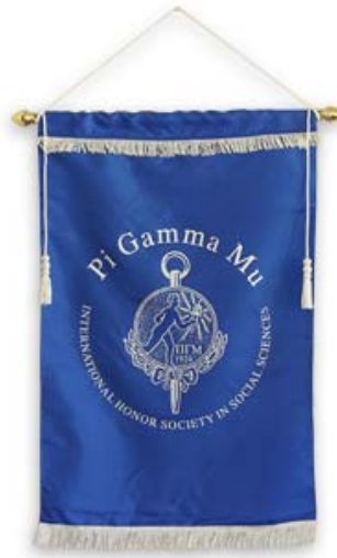
Pi Gamma Mu banner. The polyester silk-screened banner measures approximately 20" by 32", and is supported by a twisted white cord with tassels. $75

The international office offers a society banner for purchase ($75) via our merchandise page .