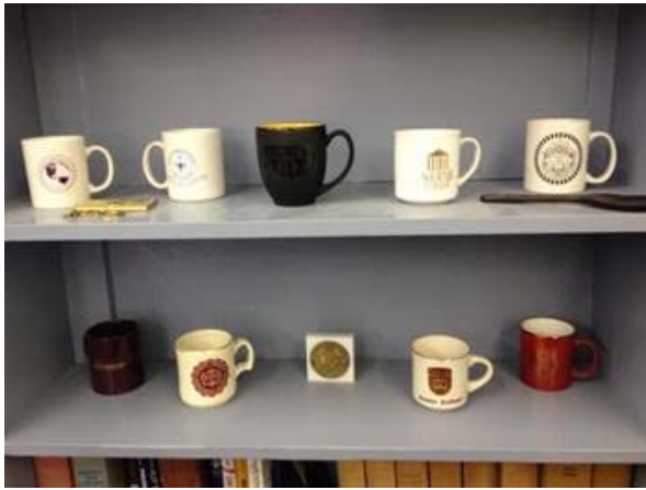
Top Row: Huron University; Kansas Newman College (now Newman University); Wichita State University; Shorter College; Campbell University. Bottom Row: Bellevue University; Evangel College; Morgan State University (paper weight); Austin College; William Carey College.