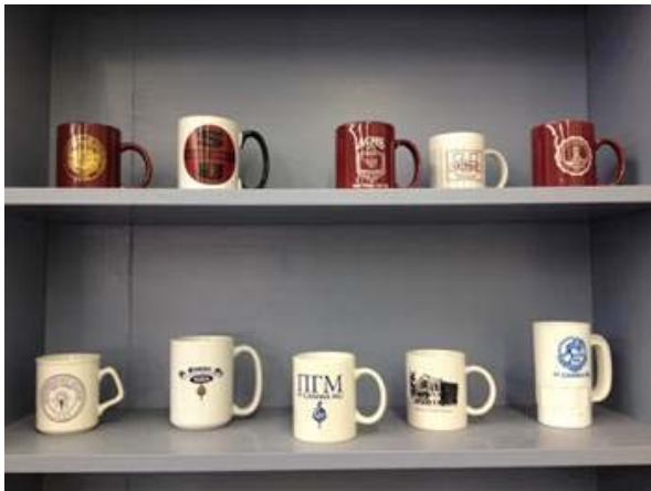
Top Row: The University of Charleston; Salisbury University; The Association of College Honor Societies; Catholic University; University of Nebraska at Omaha. Bottom Row: Southwestern College; Pi Gamma Mu International; Pi Gamma Mu International; Southwestern College; Pi Gamma Mu International.