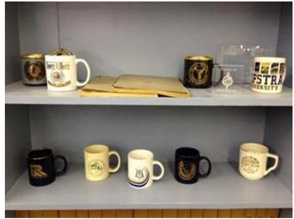
Top Row: Grambling State University; Emory & Henry College; 2 original 1930 editions of Who's Who in Pi Gamma Mu ; Ball State University; Hofstra University. Bottom Row: Radford University; Humboldt State University; East Tennessee State University; Valparaiso University; Bluefield State College.