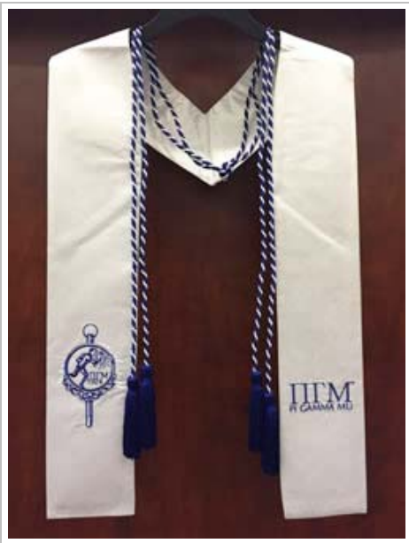
Pi Gamma Mu stole and honor cords.

Visit https://pigammamu.org/store.html to see all of our official Pi Gamma Mu merchandise including stoles, honor cords, t-shirts, tote bags, coffee mugs, and more!