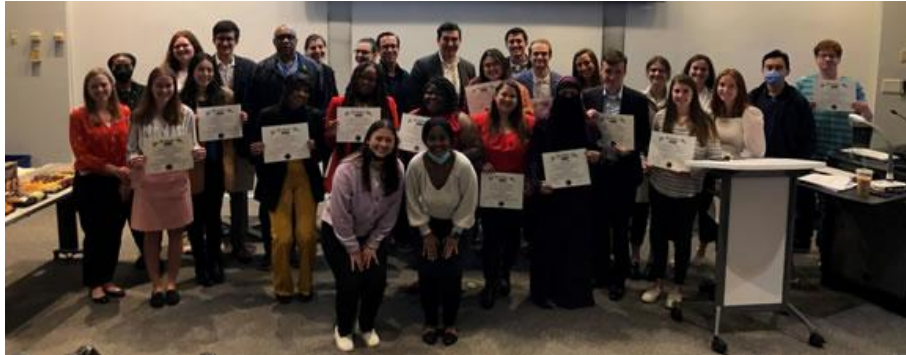
The DC Alpha Chapter at The Catholic University of America celebrated its induction ceremony on April 26, 2022.