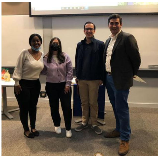
Current and New Chapter Officers at the DC Alpha Chapter