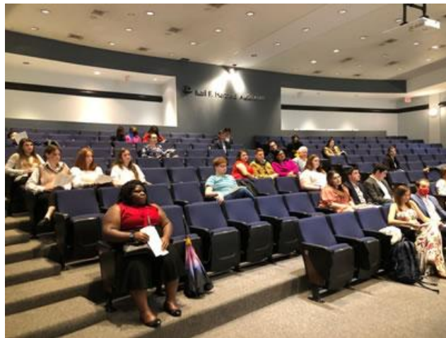
Getting ready for induction into the DC Alpha Chapter!