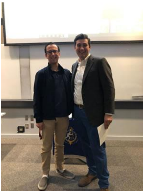
New Chapter Officers at the DC Alpha Chapter