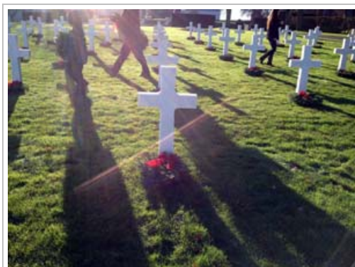
Madingley American Military Cemetery, Madingley, Cambridge, UK. One of the WV Iota chapter officers participating in one of WAA's international events.