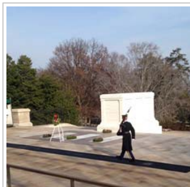
Arlington National Cemetery, Arlington, VA