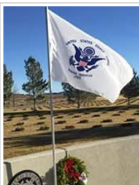
Northern NV Veterans Memorial Cemetery, Fernley, NV.