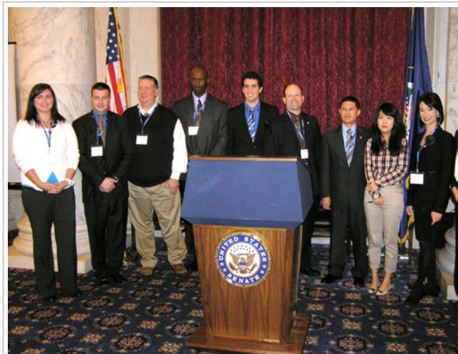
Student presenters pose at the podium at the 2011 Triennial International Convention. The highlight of the Convention was the day-long presentation of 40 members' research findings, which took place in the ornate Kennedy Caucus Room of the Russell Senate Office Building, located across from the U. S. Capitol on the northern side of Constitution Avenue in Washington, DC.