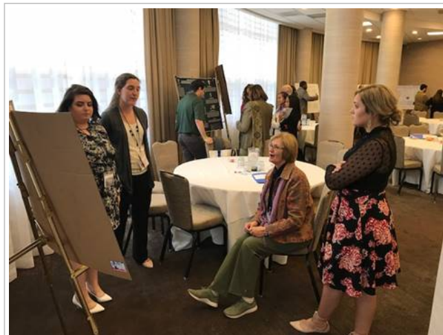
2017 Convention attendees enjoy presentations during the Student Poster Session.

Chapter Posters: Pi Gamma Mu is also interested in posters from Pi Gamma Mu Chapters. Chapter posters can exemplify the diverse strengths of our chapters and share ideas regarding a wide range of chapter-related activities including an overview of a year's activities, a chapter's history, service projects, initiations, programming, or recruitment strategies.