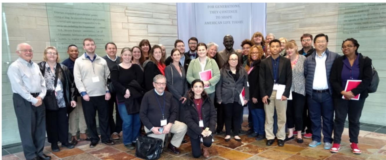
2017 Leadership Development Program Participants attend a decision-making simulation at the Truman Presidential Library's White House Decision Center in Independence, MO.

Join us for the second Leadership Development Program during the 2021 Virtual Triennial International Convention! Program participants will learn about leadership in a variety of different contexts to include leadership in academia, stressful environments, non-profit organizations, public policy and in the United States Marine Corps. The virtual event will consist of webinars, lectures, and a unique online experience with the National Museum of the Marine Corps in Triangle, Virginia. While the program is tailored for undergraduate students, graduate students are welcome to attend. Students will earn a certificate of completion for their resume upon the conclusion of the program.