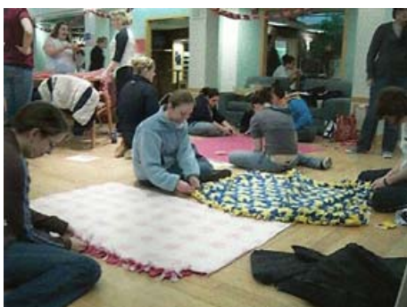
Massachusetts Delta members making blankets