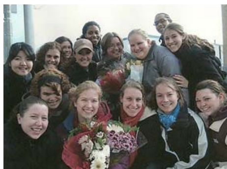
Massachusetts Delta chapter members at the bus stop after volunteering at the Food Bank

The Nebraska Epsilon chapter at University of Nebraska-Omaha gathered materials for a local low-income housing facility occupied mostly by recent refugees from Sudan. Its members gathered a substantial quantity of household supplies, personal care items, childcare items, and school supplies. One member even donated a slightly used computer.