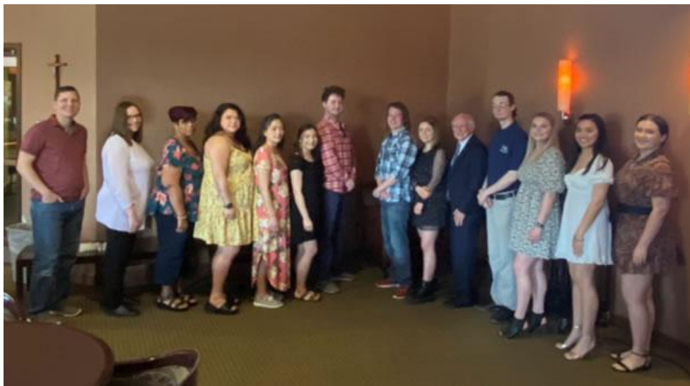
May 1, 2022 Initiation Ceremony - Attending Initiates and Chapter Officers