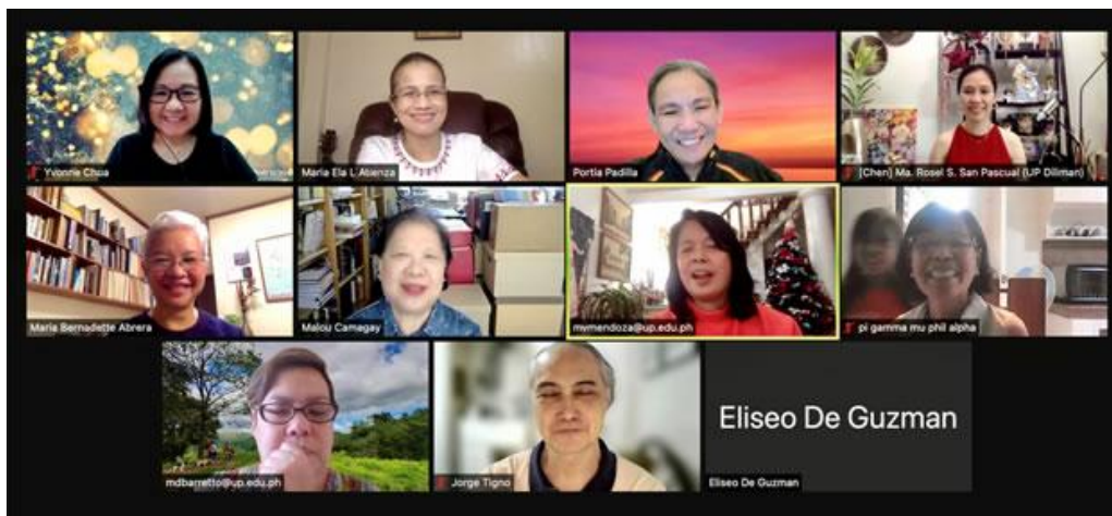
Philippine Alpha Chapter Board of Trustees Meeting