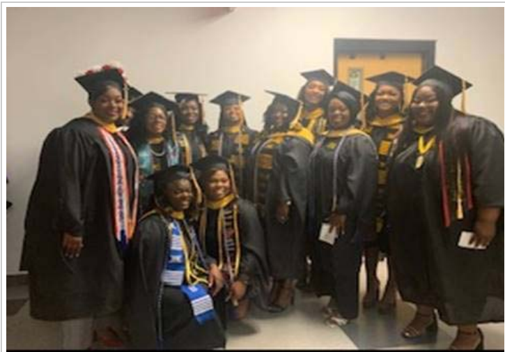
Louisiana eta chapter inductees 2023 posed for photo before great "G - March".

July 3, August 2, and 7, 2023, BEAPERs and their mentors volunteer their time and donations at Grace Ministries.