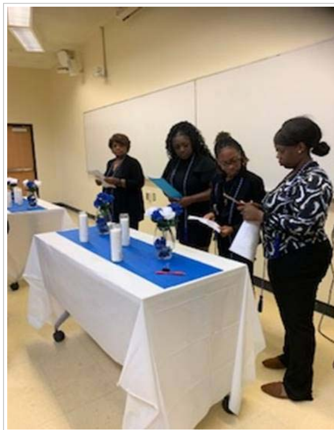
At the Spring 2023 Pi Gamma Mu induction ceremony.