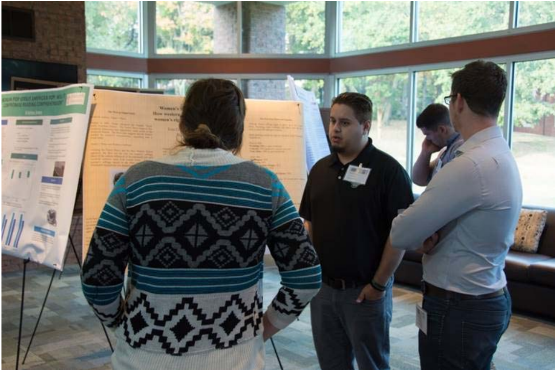
The 2016 Conference.