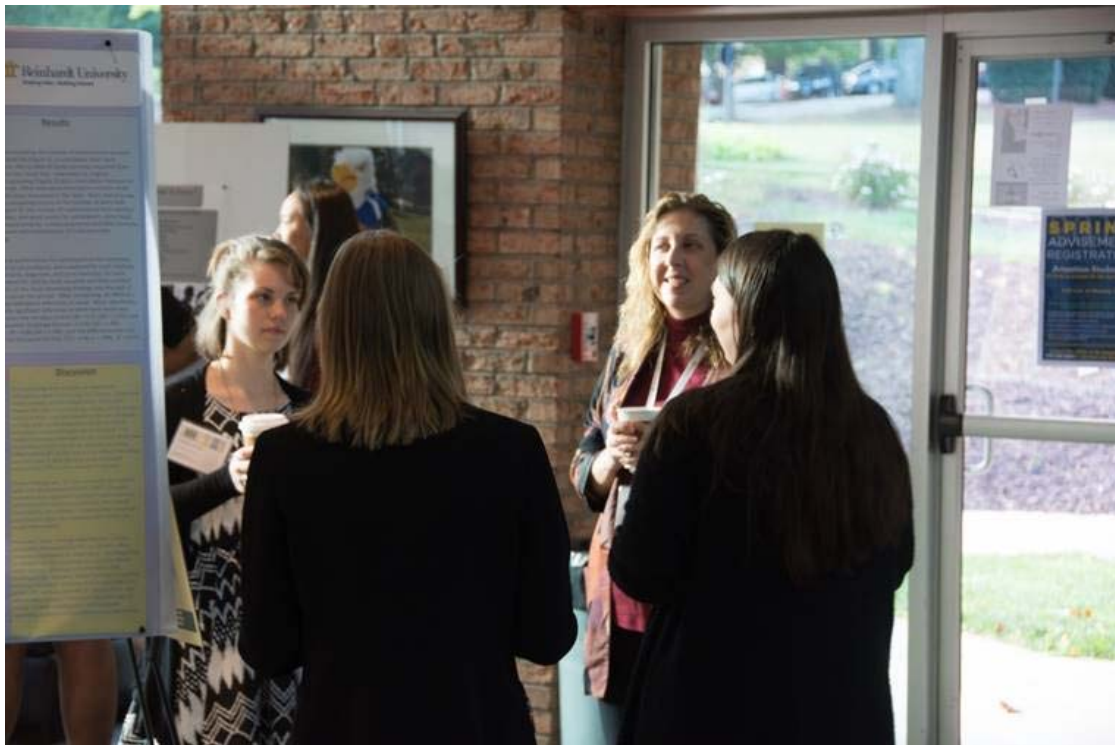
The 2016 Conference.