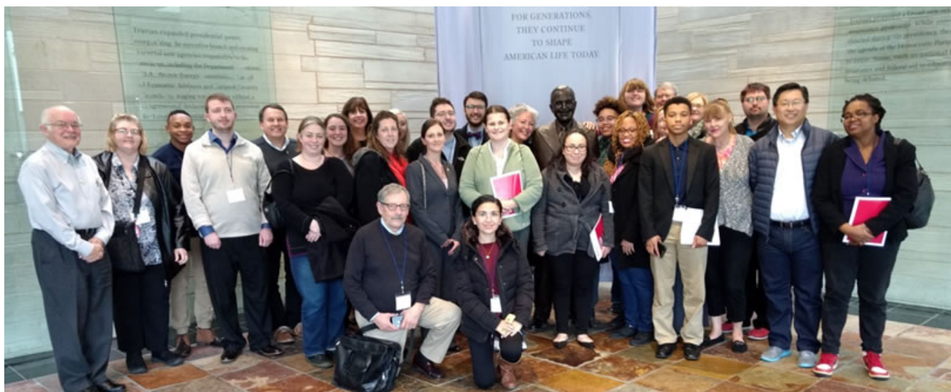
2017 Leadership Development Program Participants attend a decision-making simulation at the Truman Presidential Library's White House Decision Center in Independence, MO.

Join us for the second Leadership Development Program during the 2021 Virtual Triennial International Convention! Program participants will learn about leadership in a variety of different contexts to include leadership in academia, stressful environments, non-profit organizations, public policy, and in the United States Marine Corps. The virtual event will consist of webinars, lectures, and a unique online experience with the National Museum of the Marine Corps in Triangle, Virginia. While the program is tailored for undergraduate students, graduate students are welcome to attend. Students will earn a certificate of completion for their resume upon the conclusion of the program.