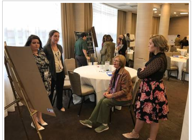
2017 Convention attendees enjoy presentations during the Student Poster Session.