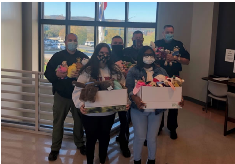
Members of the Georgia Epsilon Chapter at Shorter University donate stuffed animals for children involved in traumatic events.