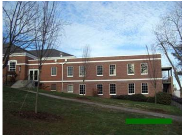
Georgia Kappa chapter has sponsored a tree that will be planted on the campus's Nature Refuge