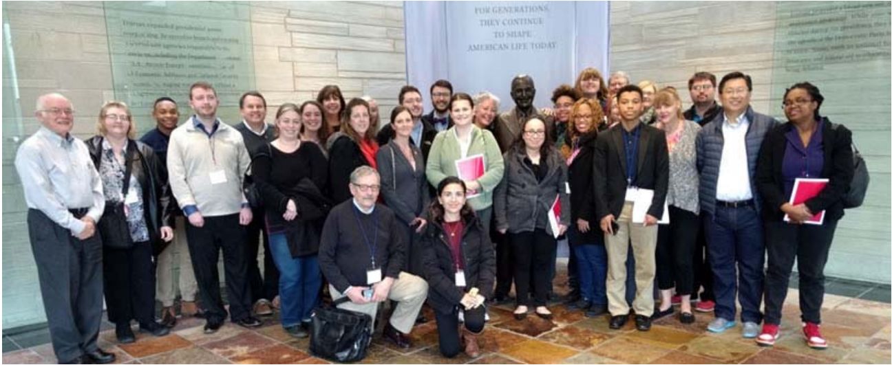
Leadership Development Program Participants and other convention attendees pose with a bronze statue of President Harry Truman at the Truman Presidential Library in Independence, MO.