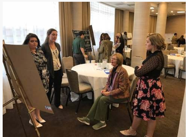
Convention attendees enjoy presentations during the Student Poster Session.